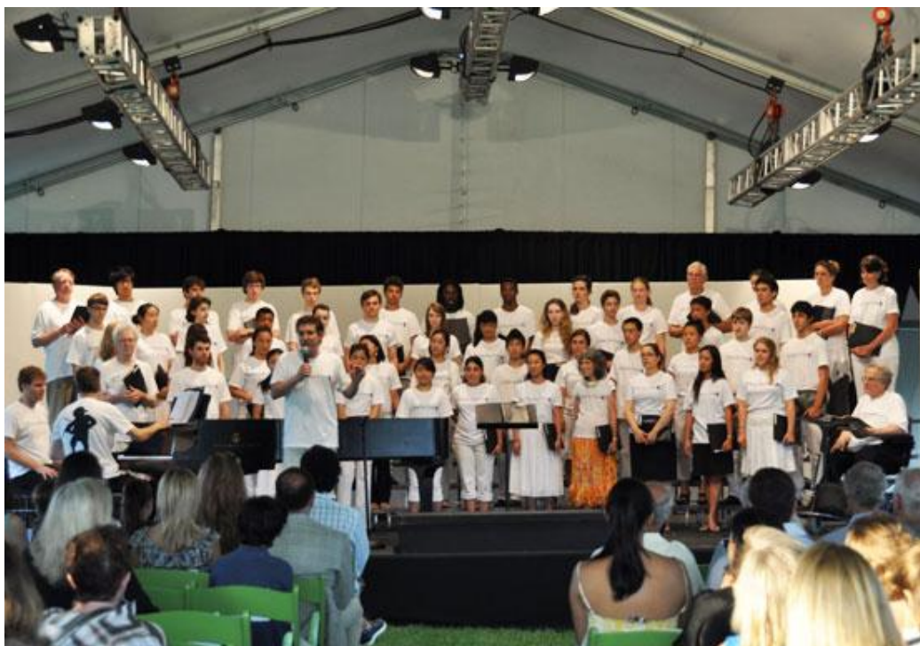
The Perlman Music Program Chorus