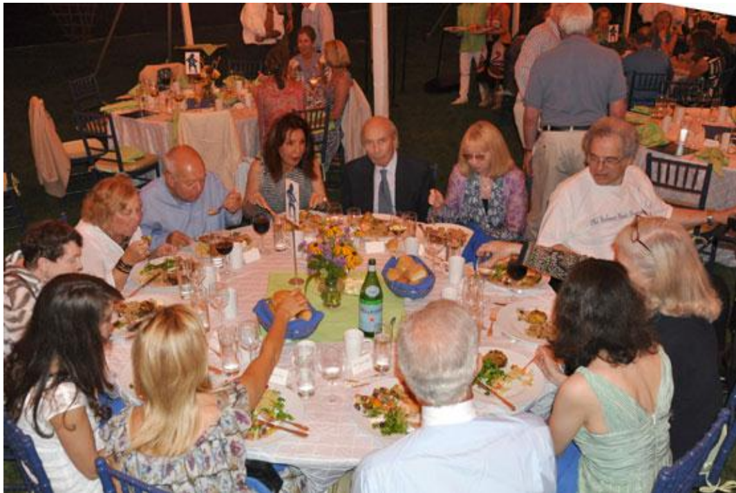
Itzhak Perlman and guests