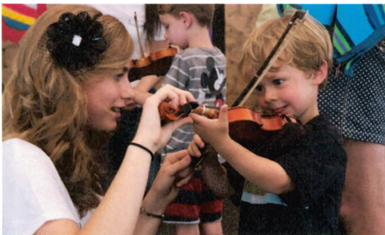
A Summer Music School student helps a budding musician get acclimated to the violin during an instrument "petting zoo" after the Annual Family Concert.