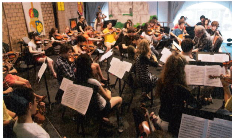
Maestro Itzhak Perlman directs the string orchestra.

Weekly student performances, called Works in Progress concerts, are an important part of the Summer Music School. These informal concerts give students the opportunity to polish and perform pieces they are currently studying, in a supportive and nurturing environment where they are free to take artistic risks without feeling the pressure associated with a formal recital. The Perlman Music Program's summer season begins with a kick-off reception and Works in Progress Concert on Friday, June 17, at 7 p.m. Works in Progress concerts are held on Friday and Saturday evenings throughout the Summer Music School and are open to the public. This summer's Works in Progress concerts will be held on July 28, and July 30 at 7:30 p.m. at the Shelter Island Campus.